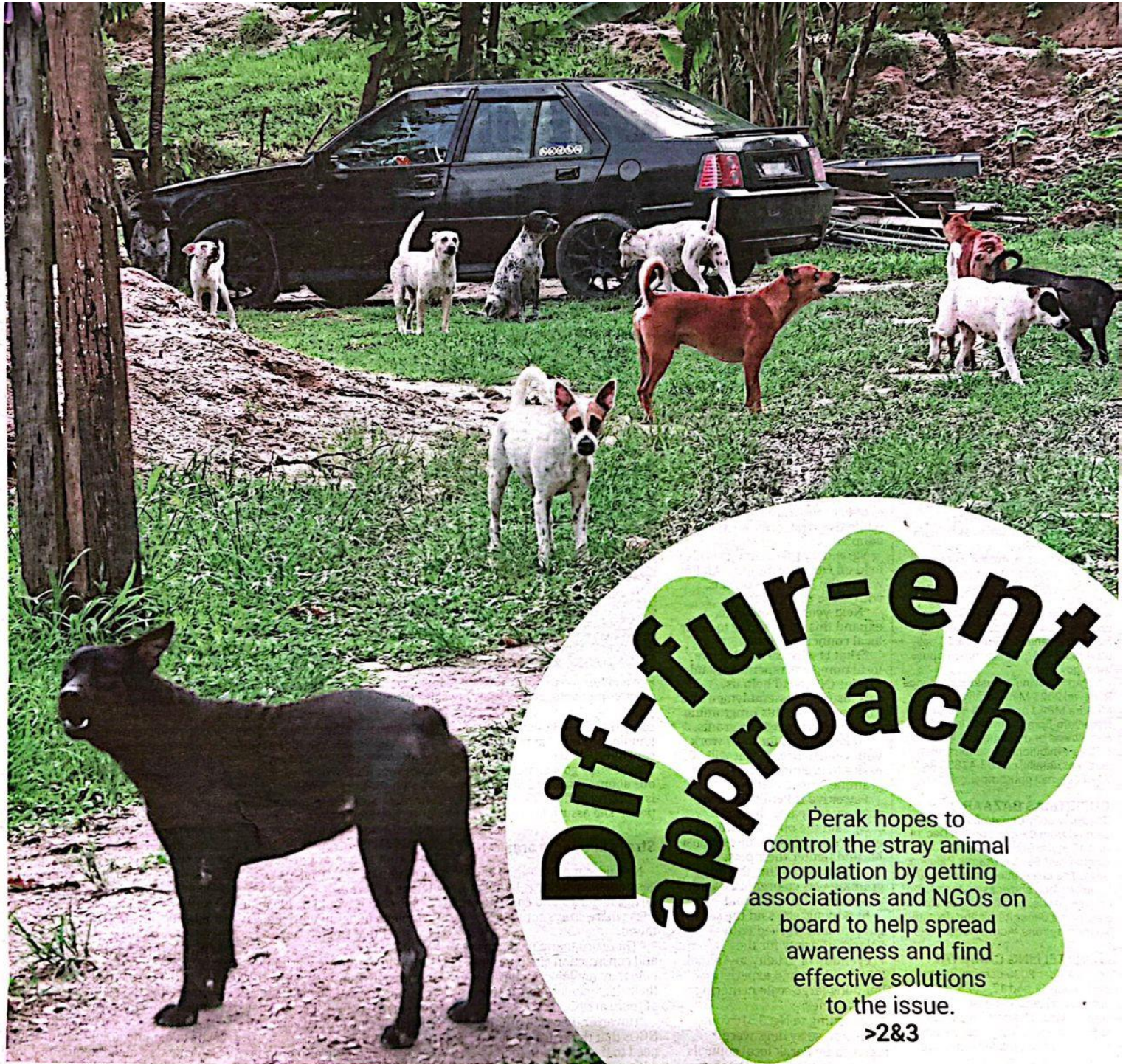
Roaming the streets: Stray dogs near a farming area at Taman Wah Keong in Ipoh, Perak.