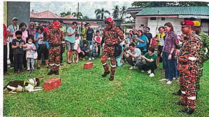
Fire and Rescue Department's K9 team helping to create awareness on how dogs can help in search and rescue operations at the Perak Pawsitive Initiative programme in Gopeng. — Courtesy photo

Perak govt looking at including various organisations in its neutering initiative