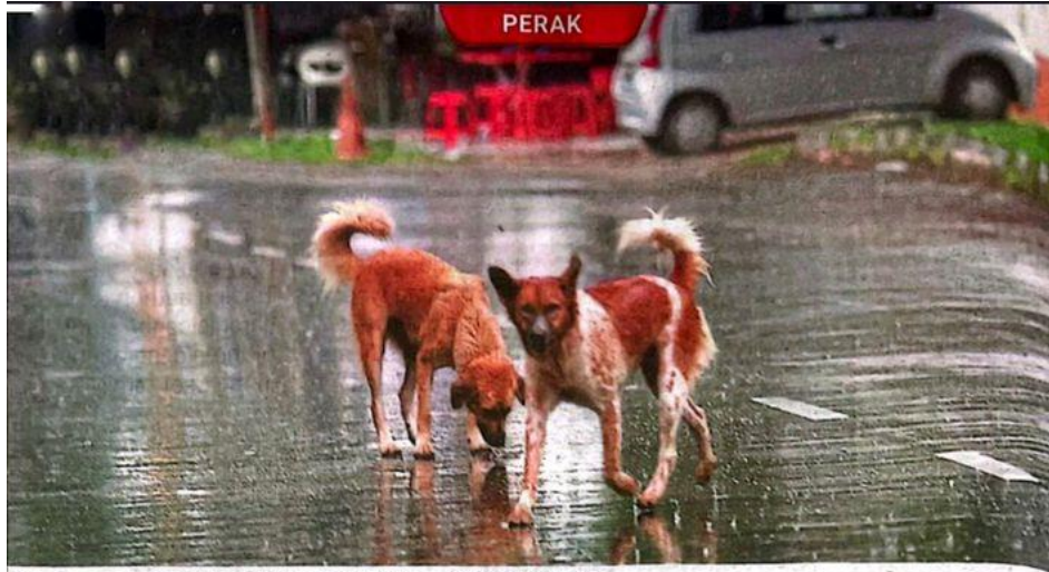
Stray dogs roaming around a residential area in Ulu Kinta.